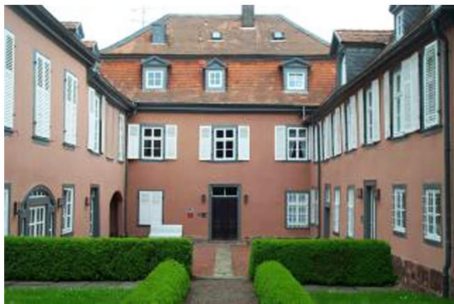
Schreibersches Haus Museum Bad Arolsen Germany