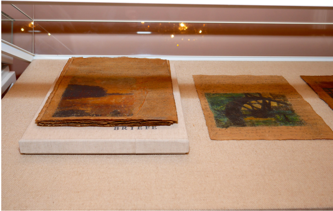
Briefe , portfolio of 15 drawings in box, mixed media, Xerox Transfer and sand on paper, each 9 3/4 x 13 inches, 2016