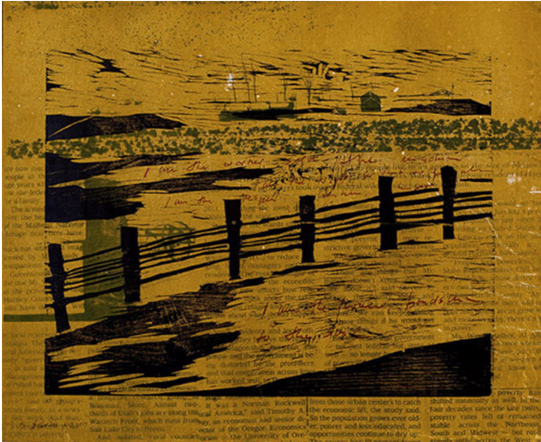
Let America be America Again IV , color woodcut on blueprint, 24 x 30 inches, 2017