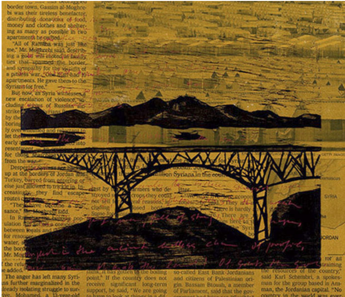
Let America Be America Again II" Let us build Bridges "color woodcut on blueprint, 24 x30 inches, 2017