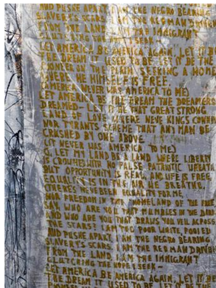
Let America Be America Again I , mixed media on linen, 38 x 78 inches, 2017 Text overlay: excerpts from Langston Hughes : Let America Be America Again, woodcut printed on organza Above left: Instalation view Right: detail with text