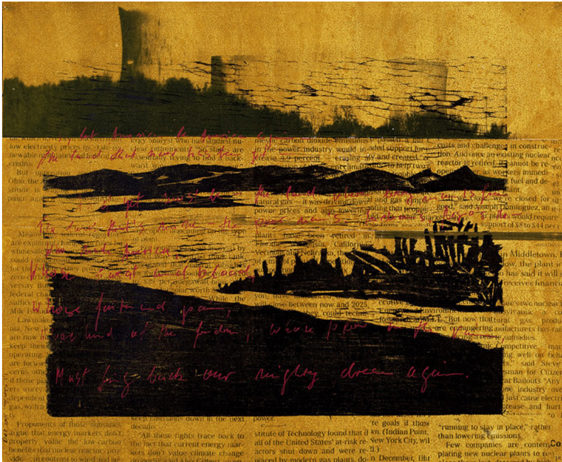
Let America Be America Again V "color woodcut on blueprint, 24 x30 inches, 2017