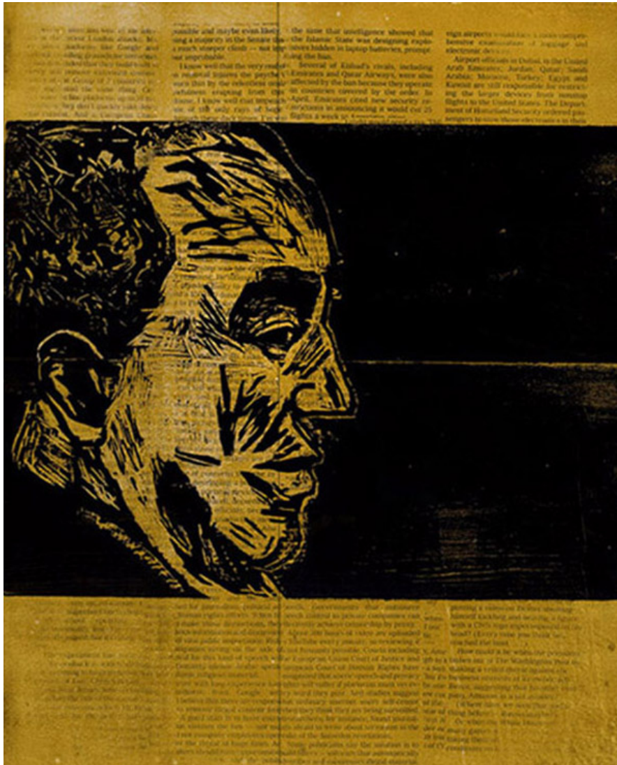
Langston Hughes , color woodcut on blueprint, 24 x 30 inches, 2017