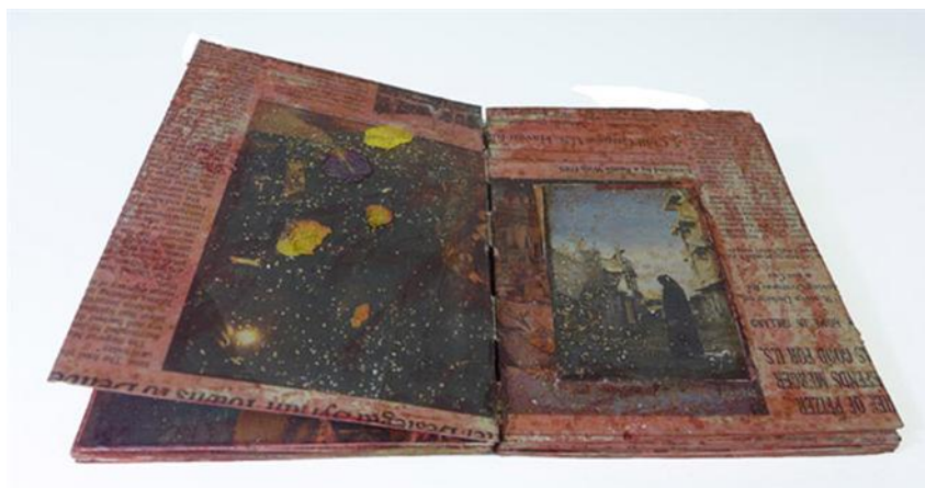
Let America Be America Again 2 , mixed media on linen, 38 x 78 inches, 2017 Text overlay: excerpts from Langston Hughes : Let America Be America Again , woodcut printed on organza Above left: Detail Right: Diaries of Conflicts book XVI, 2017